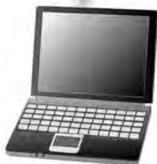
Computer with USB port

Conversion Adapter Please decide the length as much as you need (not include, but common use)